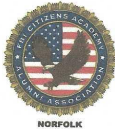
Exhibit A for FBI Norfolk Field Office and FBINORCAAA 2021 MOA